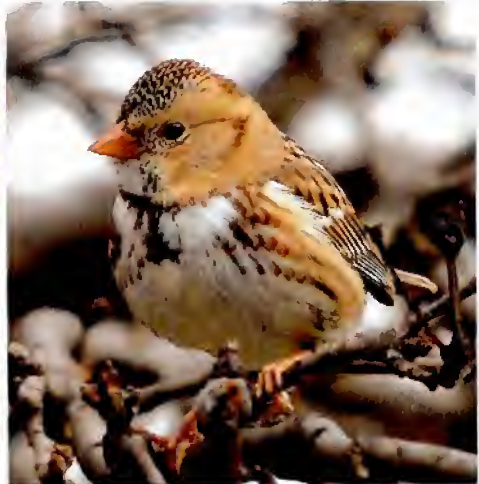
Figure D. Yellow Warbler, Ithaca, Tompkins Co., 31 Dec 06, copyright Kenneth Rosenberg. Figure E. Harris's Sparrow, Irondequoit, Monroe Co., 23 Dec 2006, copyright Richard Ashworth.